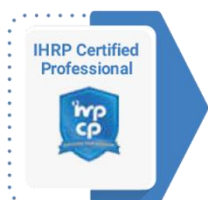
IHRP Certified Professional (IHRP-CP)

IHRP Certified Associate (IHRP-CA): New and aspiring HR professionals, or HR consultants, with less than 3 years of HR working experience and support the HR team in day-to-day HR operations and HR intervention strategies. Also applicable for students and mid-career switchers who are interested in pursuing HR related roles.