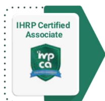
IHRP Certified Associate (IHRP-CA)

You can find out more about the different certification levels, and the related sub-competencies below.