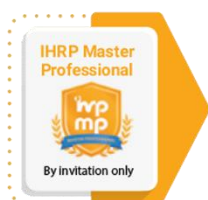
Master Professional (IHRP-MP) (By Invitation only)

Consultants at an equivalent experience level whose work is directly relevant to HR are also eligible.