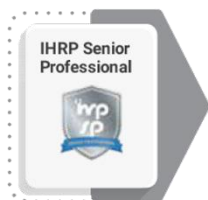
IHRP Senior Professional (IHRP-SP)

Consultants at an equivalent experience level whose work is directly relevant to HR are also eligible.