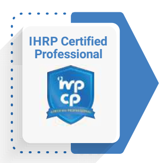
IHRP Certified Professional (IHRP-CP)