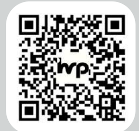
Learn more about IHRP BoC