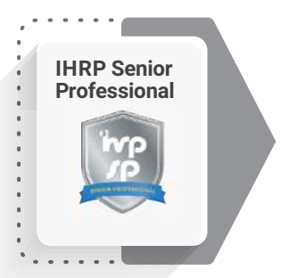
IHRP Senior Professional (IHRP-SP)