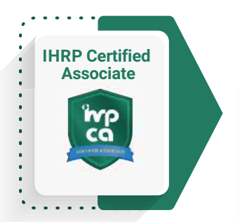
IHRP Certified Associate (IHRP-CA)

The refreshed BoC reflects the four IHRP certification levels and follows a "building block" or cumulative approach; this means that at the higher levels, such as Senior Professional, the ability to demonstrate the performance statements of the lower levels is implied.