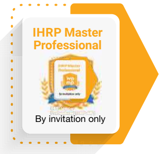
IHRP Master Professional (IHRP-MP) (by invitation only)